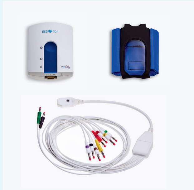
*Carrying case available with ECG Top BT