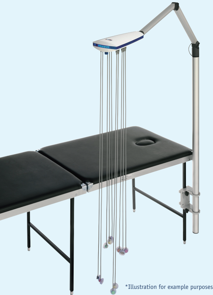
*Illustration for example purposes